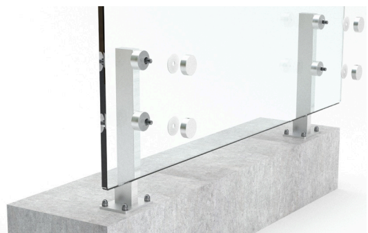
4. Secure the glass with the top part of the standoffs.