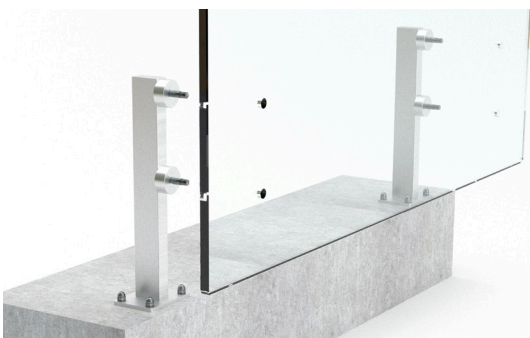
3. Place plastic protectors and insert the glass